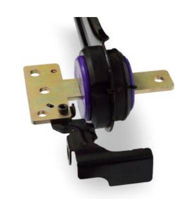
Figure 4 - fitted image of PFR19-1917