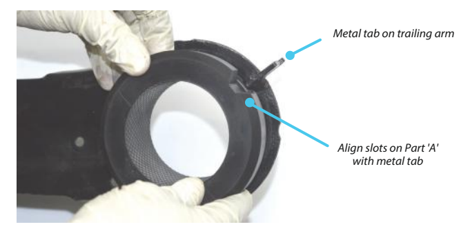
Figure 3 - Align slots on part A with welded tab on trailing arm