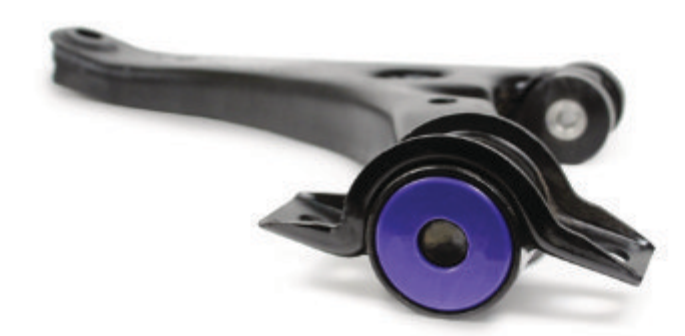
Figure 2 Assembled View

POWERFLEX +44 (0) 1895 460033 sales@powerflex.co.uk www.powerflex.co.uk