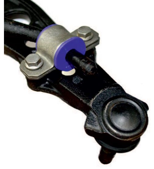
Fig. A Fig. B Fig. C